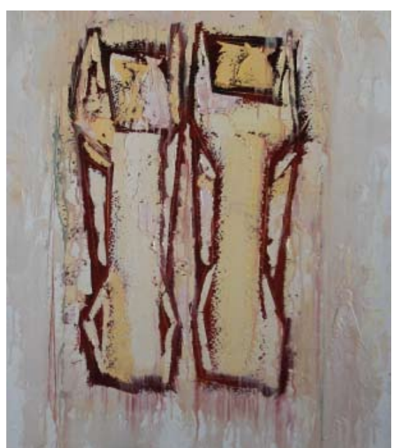
Monkhor Erdenebayar, Snowbound, 2009, oil on canvas, 80