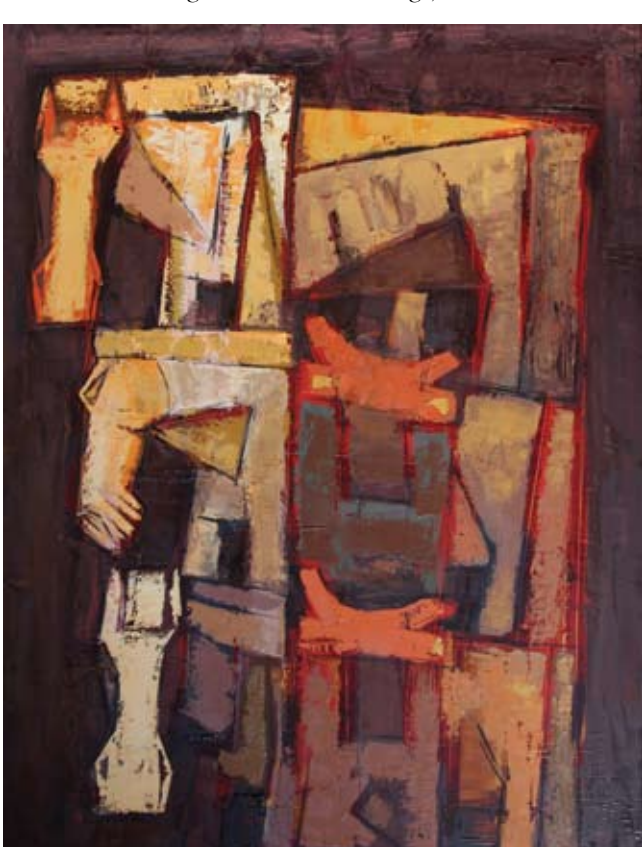
Monkhor Erdenebayar, Ready to Go, 2009, oil on canvas, 130 x 100 cm.

(2008), and Ready to Go (2009) all have a suggestion of cubist geometry. Two of the clearest examples of this are Red Moon Series No.2 and Ready to Go. The artist agrees with this while pointing out "this painting is related to ancient rock carving. I think these works, and many others, have