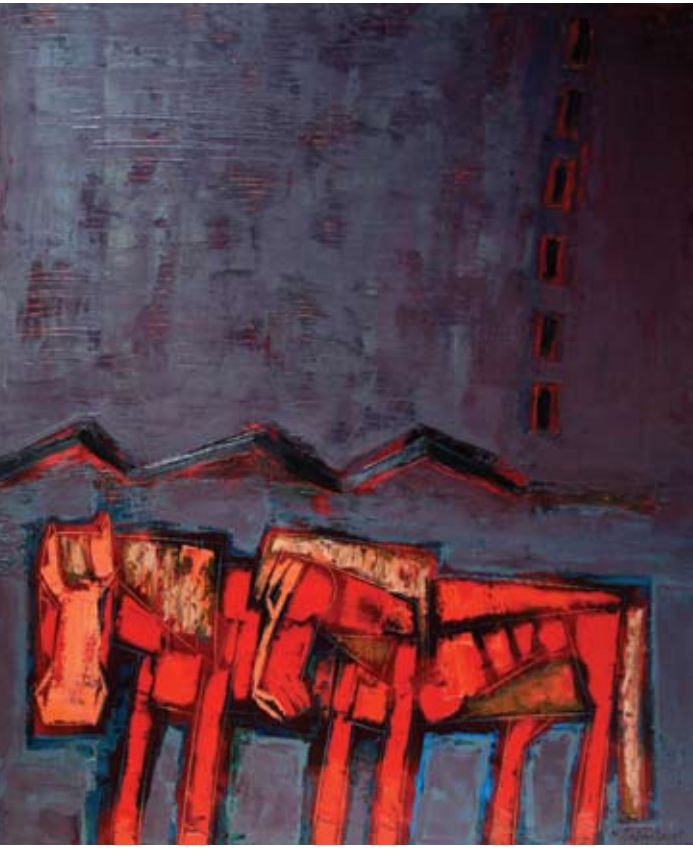
Monkhor Erdenebayar, In the Summer Rain, 2007, oil on canvas, 150 x 120 cm.