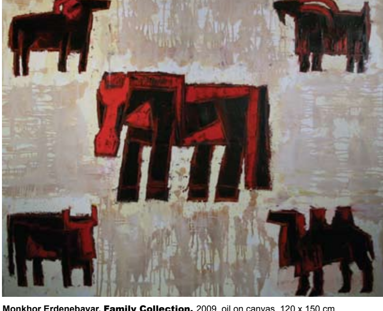
Monkhor Erdenebayar, Family Collection, 2009, oil on canvas, 120 x 150 cm.

the look of having been carved from rock sometimes wonders about this but he also and are sculptural."