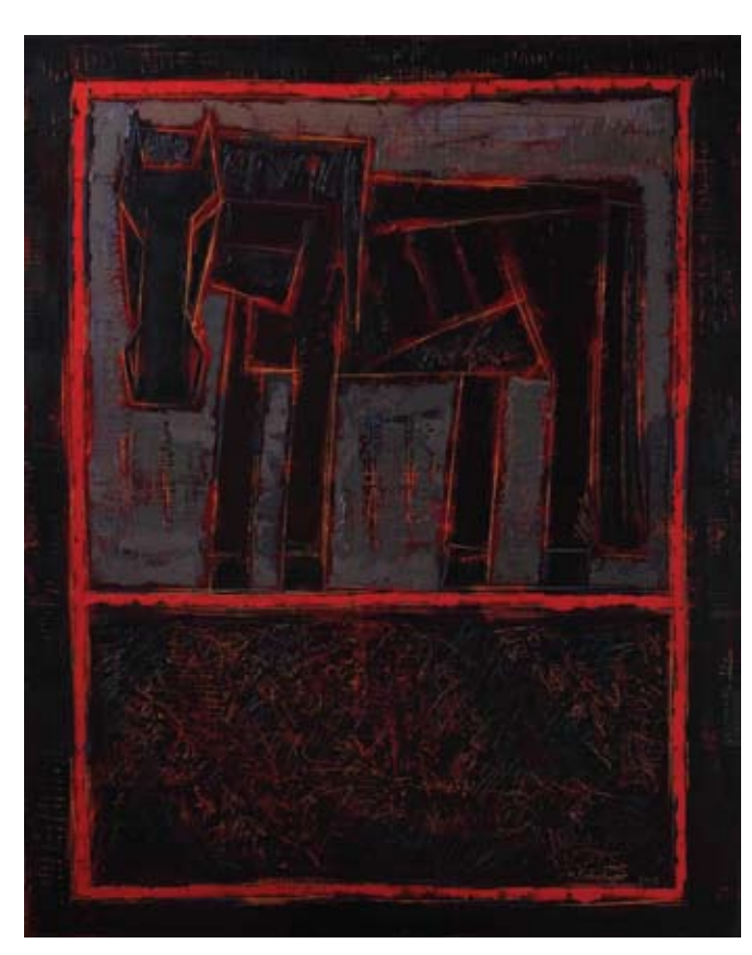
Monkhor Erdenebayar, Secret Series No.1 Red Line in Black, 2009, oil

ties afforded them by democratic change to celebrate their culture with energy and openness: in art they embraced new forms and styles, new subjects and themes. In 1993, however, while his contemporaries turned to more modern subjects and Western-inspired styles and forms, from impressionism to abstraction, Erdenebayar made a conscious decision to adopt the horse as his central subject. For Erdenebayar, or Bayar as he is known, his horses in the vastness of the steppe or in the ruggedness of the mountains are the symbol of free spirits that speak to Mongolian history, ancient traditions, and culture in ways that cannot be achieved through painting scenes of Mongolian life as it is lived in a city such as contemporary Ulaanbaatar. Through the horse Erdenebayar is able to question his history, to see it, sometimes in a somewhat sentimental light, sometimes in an objective